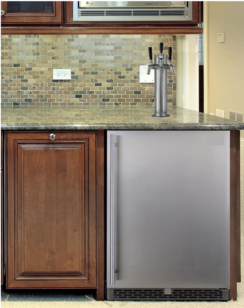
S.S front undercounter Built-in Kegerator ND-1600WTD