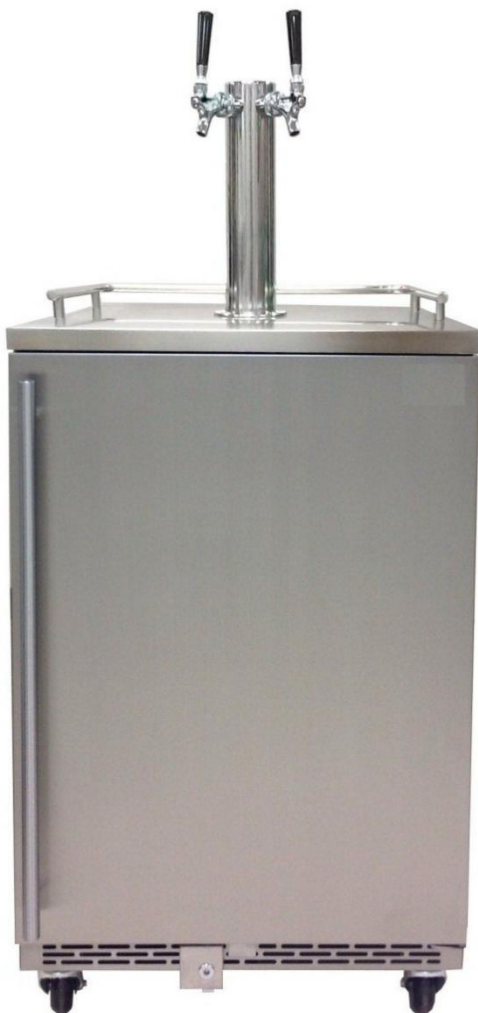
SS top SS front model ND-1600STD