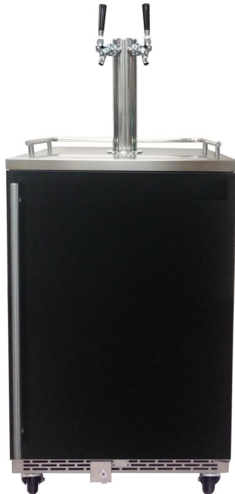
SS top black front model ND-1600STB