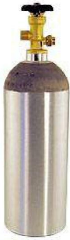
5lb DOT certified co2 tank: