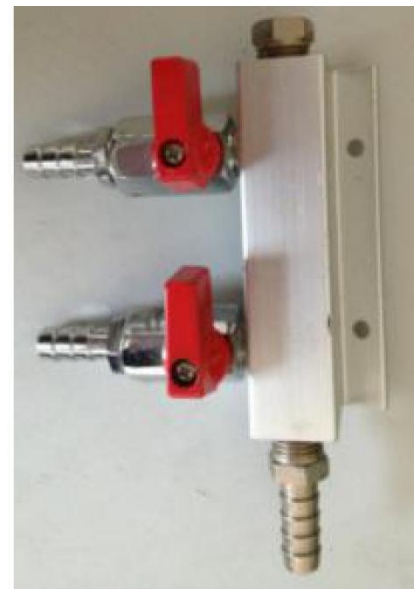
Two way gas distributor: