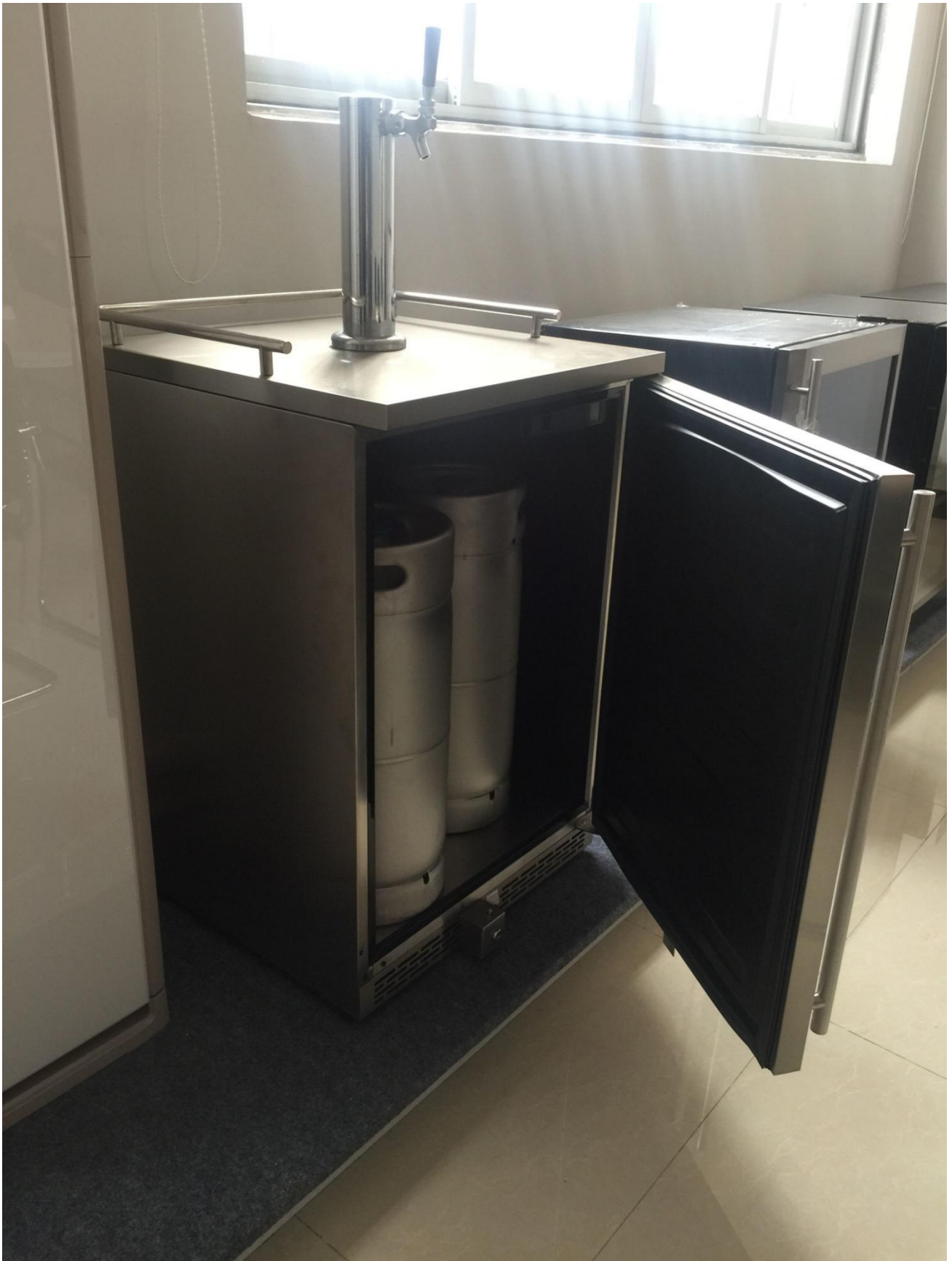
Full Stainless Steel Exterior Model ND1600FSS