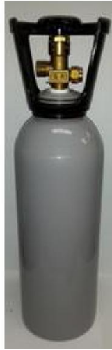
4L CE certified Co2 tank: