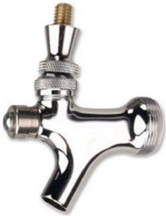
Self-closing beer tap

Brass:10USD stainless steel:40 USD Stainless steel :21 USD