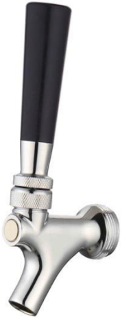
Non flow control beer tap