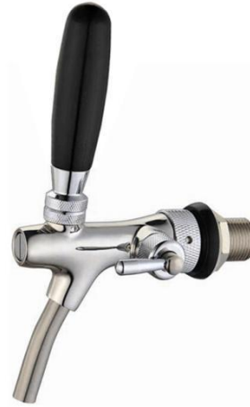
Flow control beer tap

brass: 20 USD stainless steel: 40 USD for Euro standard 40 USD for American standard